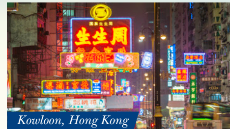
Kowloon, Hong Kong

Kowloon in Hong Kong is in the Hung Hom area situated close to the exit of The Cross Harbour tunnel from Hong Kong Island. The city has traditionally been home to blue- and white-collared