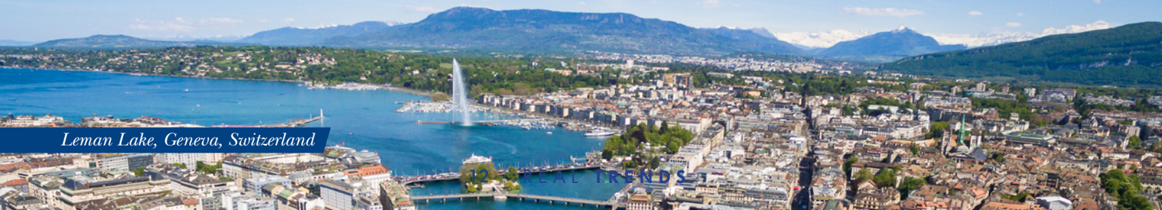
Leman Lake, Geneva, Switzerland

Another hotspot that Knight Frank lists in Geneva, Switzerland, a sophisticated lake city. Steady development and price growth are happening in the Trois Chênes area, east of the city, which has been transformed into a new transport hub. A new rail link with the French Alps will provide fast connections to Evian and other cities in France as well to the Geneva Airport. Freehold two-bedroom apartments in Trois Chênes start at $900,000 while four-bedroom homes are selling for $1.6 million and upwards. Other hotspots in the Knight Frank report include the Wynyard Quarter, Auckland; Chelsea, London; St. Kilda Road Precinct, Melbourne; Applecross, Perth and the Pasadena area of Los Angeles, California. These areas are all demonstrating strong price appreciation and are likely to attract savvy home buyers and investors in 2019. 🏠